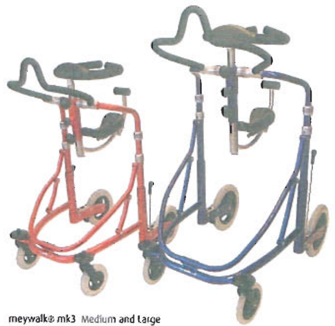
meywalk® mk3 Medium and Large