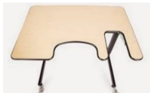
Double cut-out for swing away joystick

Items with an ( * ) are special order, please allow extra time for production. All Can-Dan ERGObables are built to order at our facility in Ancaster, Ontario.