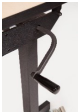
Hand crank for height adjustment