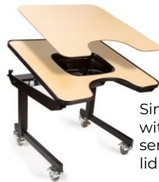
Single cut-out with optional tilt, sensory bowl and lid