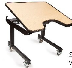
Single cut-out with optional tilt