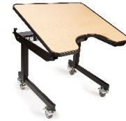
Single cut-out with optional tilt