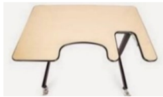
Double cut-out for swing away joystick

Items with an ( * ) are special order, please allow extra time for production. For a quote, send your completed order form to quotes@can-dan.com . To place an order, send your completed order form to order@can-dan.com . An order form is required to receive a quote. A quote or completed order form is required to process your order.