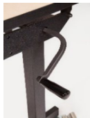
Hand crank for height adjustment