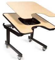
Single cut-out with optional tilt, sensory bowl and lid