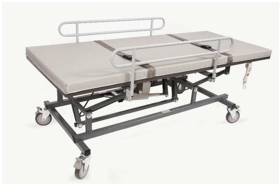
Above: Change Table with optional Side-Rails