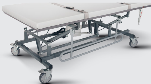
Mobile Changing Tables