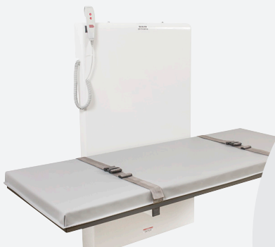
Wall Mount Changing Tables