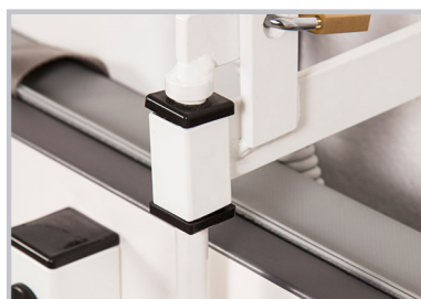
Fold Up Locking Mechanism

*Conforms to UL standard 73 and certified to CSA standard C22.2 #68