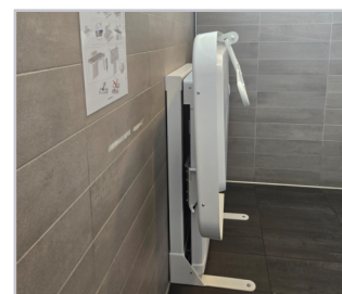
Optional Floor Stand for Wall Mount Change Tables. (Part # 20-24-FL)

*Mattress: 18 oz vinyl material, latex-free, lead-free, phthalate-free, fire retardant to NFPA 701 USA and CAN/ULC-S109 standards. Mildew resistant.