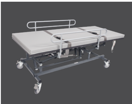
Legacy Mobile Change Table