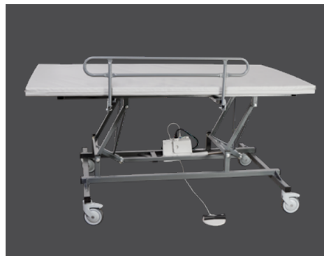
XL Mobile Change Table with Optional Foot Control