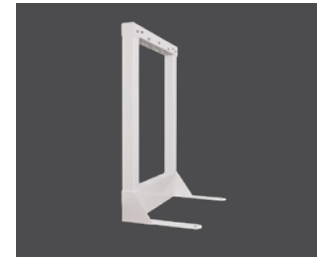
NextGen Floor Stand